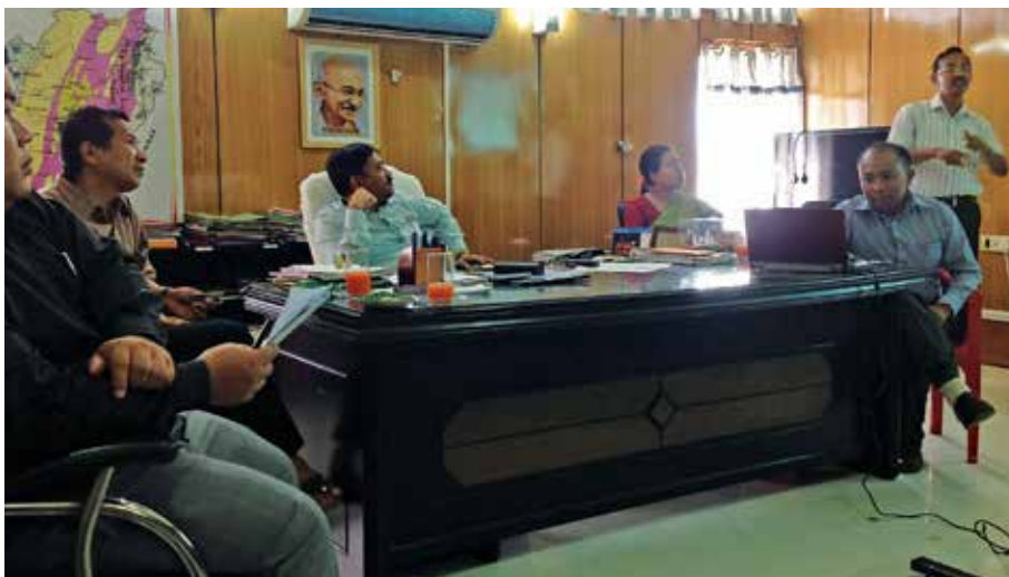
SIO Manipur explaining the system

within one month from the date of online filing of the application, the online acknowledgement is treated as cancelled and same is displayed on the website.