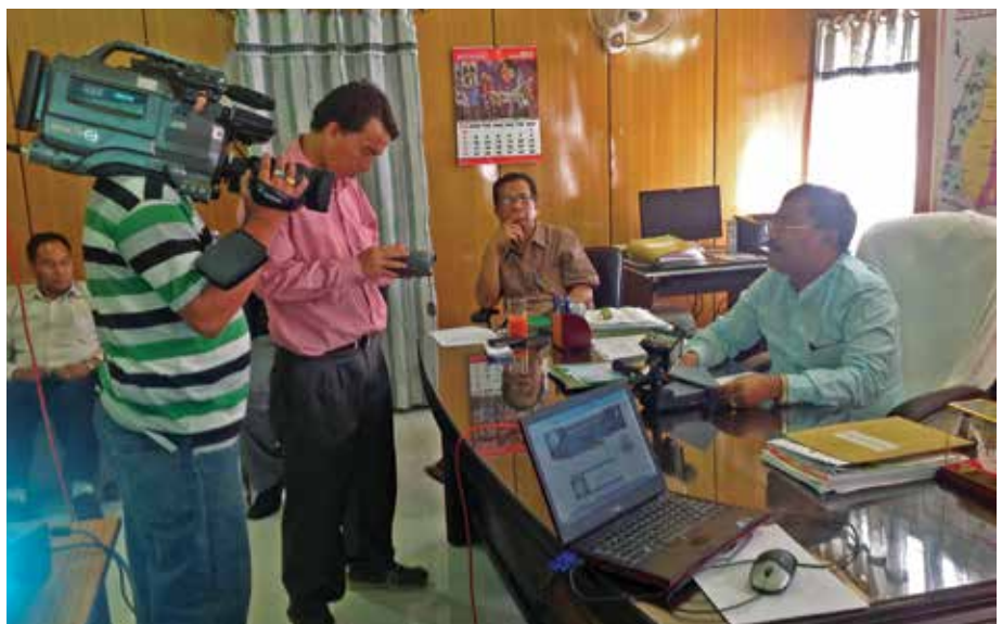
Hon'ble Minister Shri Govindas Konthoujam inaugurating the system

Scientific Officer/Engineer – 'SB' sharat.laishram@nic.in